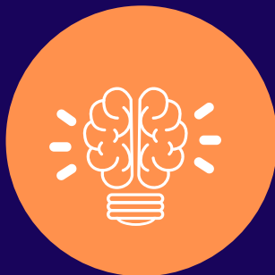
Resilience & Growth Mindset