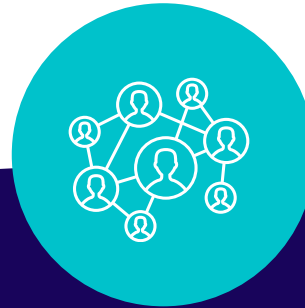
Networking and your Leadership Brand