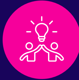
Self-Aware Leaders and DISC training