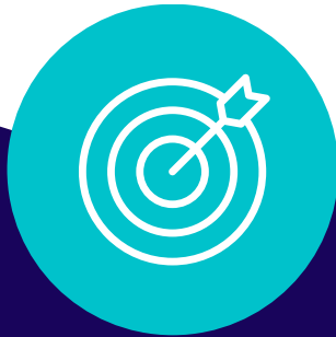
Time & Energy Management