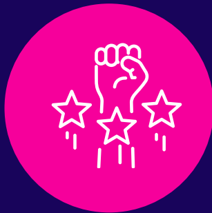
Taking Control of Your Career