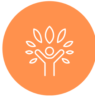
Leader as Coach