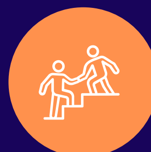
Interview Skills for Managers